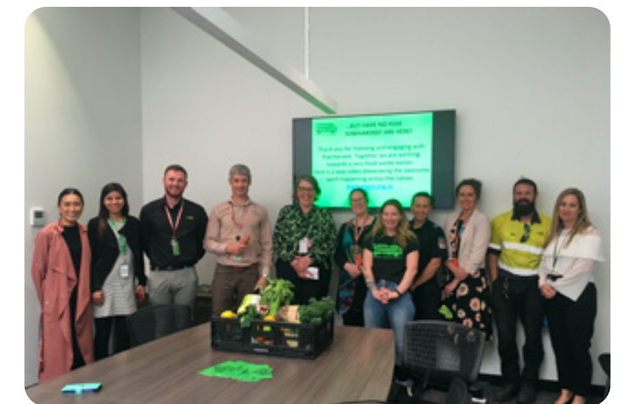
Queenstown Airport Wellness Awareness Week talk

By building understanding of how food rescue works in our community, more people are also becoming aware of the charities that operate in the district and where they can gain support should they, or anyone they know need it.